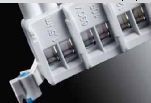
All terminals with 2 clamping units per pole