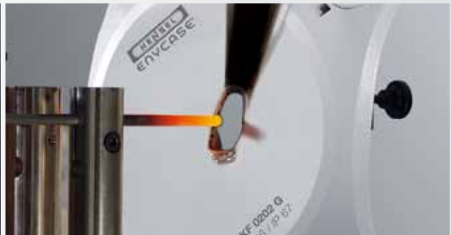
Burning behaviour in glow wire test 960°C High impact withstand IK 09 (10 joule)