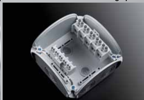
Different terminal positions and fastening options