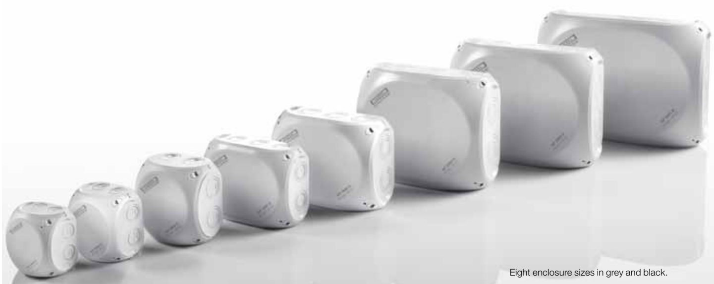
Eight enclosure sizes in grey and black.