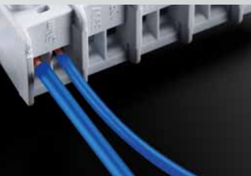
Various conductor cross sections and conductor types