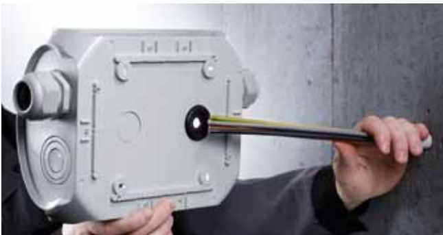
Cable entry also possible from the rear side