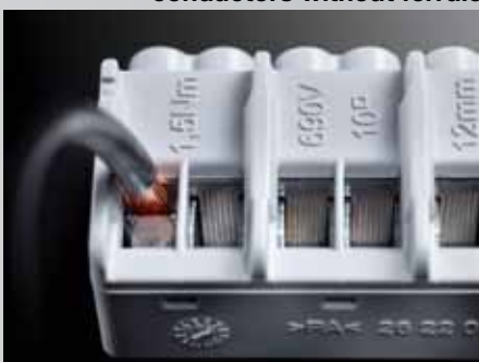
Terminals prevent damage of conductors, also for flexible conductors without ferrule