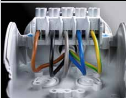
High-position terminals with more space for wiring